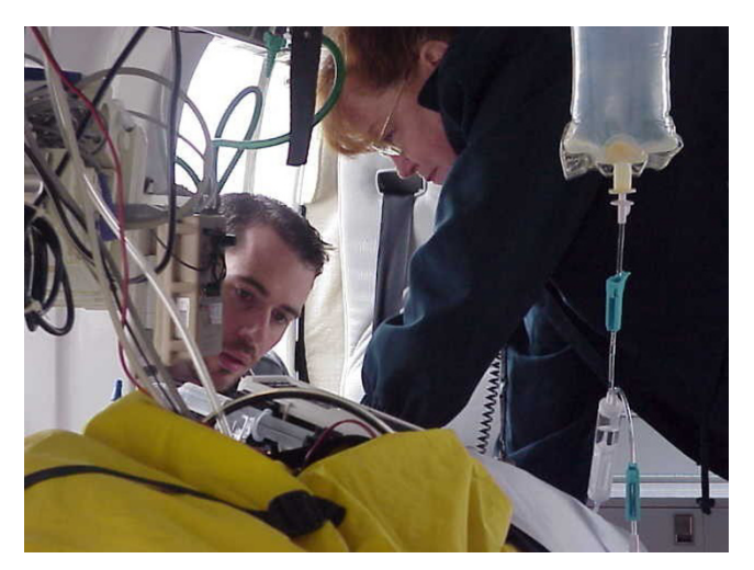
Figure 4 Instructors Making Finals Preparation for Simulation.

ing concerning the simulated patient's medical condition, prior to boarding the helicopter. One of two pre-programmed simulations was conducted for each resident. The first simulation mimicked a young woman who had been involved in a motor vehicle accident. The simulation began after she had been loaded into the helicopter on a backboard with cervical spine protection in place and with one intravenous line established. Shortly after the simulation starting point, the patient exhibited signs of hypovolemia and tension pnuemothorax and requires fluid resuscitation, needle thoracostomy, and endotracheal intubation. The second simulation represented a middle-aged man sustaining an anterior myocardial infarction. He had received thrombolytic therapy and was being transferred to a tertiary care hospital for acute intervention. At the beginning of the simulation he underwent ventricular fibrillation and required advanced cardiac life support and endotracheal intubation.