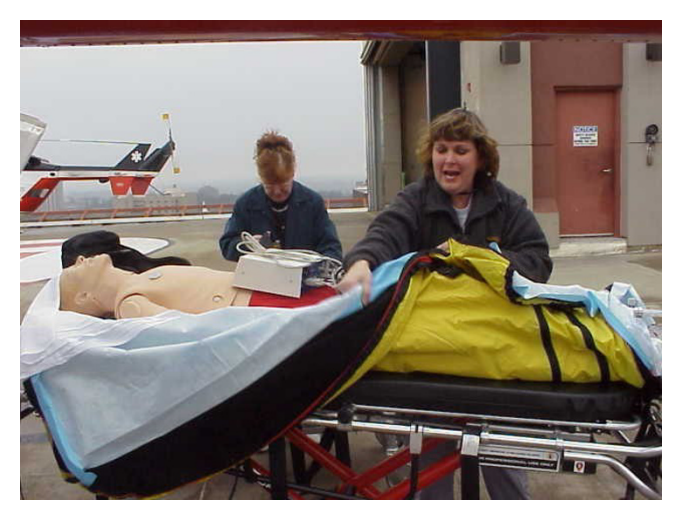
Figure 2 Simulator Ready for Loading into Position.

maneuvering, all of which involve hovering and low speed flight[25]. During cruise, combined ride values[26] of around 0.8 ms-2 r.m.s. are expected, which are likely to be "fairly uncomfortable" for seated personnel. Measurements in transport helicopters suggest that vibration magnitudes experienced while standing on the ground are typical of those that occur in cruising flight, provided that the engines are running at flight idle; in aircraft where it is normal practice to reduce the engine revolutions while standing on the ground, the rotation frequencies will be lowered, altering the spectral shape of the vibration[25].