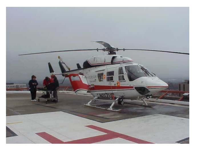
Figure I BK-117 EMS Air Ambulance Prepared for Flight.

The aircraft was run at flight idle setting to provide noise, vibration, lighting, olfactory input and heat similar to the conditions encountered during flight. The largest vibration acceleration magnitudes on the airframe tend to occur at the main rotor passage frequency. Typical 4-blade helicopters have rotor passage frequencies between 17 and 20 Hz. The vibration is multi-directional, with similar magnitudes in all three translational axes. The highest vibration magnitudes occur during landing, take-off or